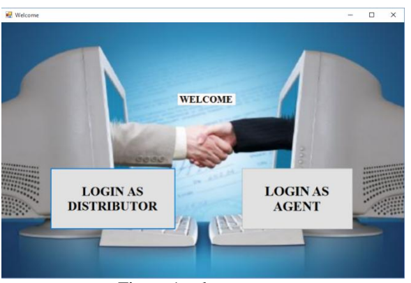
Figure 1 welcome page

the distributed set also been considered. Such objects do agents. not correspond to real entities but appear realistic to the Distributor chooses the random fake object to allocate for agents. In a sense, the fake objects acts as a type of the remaining agents. watermark for the entire set, without modifying any Step6: Estimate the probability value for guilt agent. individual members. If it turns out an agent was given one To compute this probability, we need an estimate for the or more fake objects that were leaked, then the distributor probability that values can be guessed by the target. can be more confident that agent was guilty.